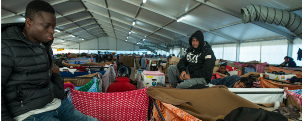
Figure 2. Migrant living conditions in the CDA of Cona, Italy [7]

2.3 The third potential impact is due to the fact that Italy may be at a different stage of the COVID-19 pandemic compared to migrants' countries of origin. After the Decree of the Italian Prime Minister of April 26 th , Italy moved into the so-called "phase two", an intermediary period between the current strict lockdown, and "phase three", during which the country will begin its gradual return to normality. However, many African countries are instead in "phase one" i.e. an exponential growth of cases [8]. As migrants arriving in Italy by sea cross through multiple African countries (figure 3) [9], the potential risk of contagion along this route, as well as the risk of epidemic amplification in Libya's detention camps due to poor living conditions, also represents a risk of COVID-19 reintroduction in CARA and CDAs.